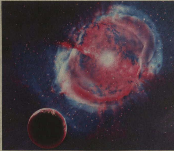
STELLAR FIND: An artist's conception of an Earth-like planet orbiting an evolved star that has formed a stunning 'planetary nebula'

With a diameter just 12% bigger than Earth, Kepler-438b has a 70% chance of being rocky, according to scientists. Kepler-442b is about one-third larger than Earth but still has a 60% chance of being rocky.