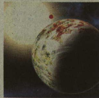
Three of the newly-validated planets are in habitable zones.